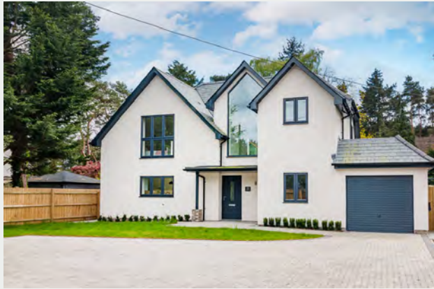
Ashley Heath £850,000

A stunning brand new contemporary home built by renowned developers | Boasting a large West-facing garden | Large frontage with off-road parking | High-spec interior with open-plan living | Sleek kitchen with Quartz worktops