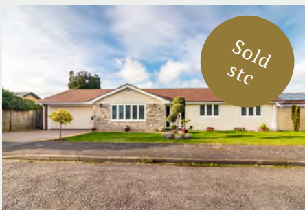
St Leonards £675,000

View available properties online fellsnewforest.com