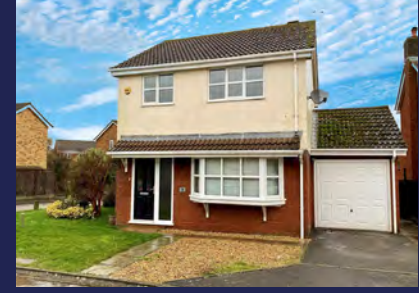
Ringwood £1,750 PCM

A one of a kind detached family home. Four Bedrooms | Two Reception Rooms | Three Bathrooms | Driveway Parking | Boat & Caravan Park | Large Westerly Facing Garden | Walking Distance to Town Centre |