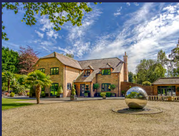
Hangersley Hill £3,000,000

A detached modern house in Ringwood. Three Bedrooms | One Reception Room | One Bathroom | Garage | Conservatory | Patio Area | Close To Local Amenities | Front & Rear Gardens | Short Drive to Town Centre.