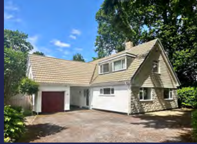
West Moors £775,000

A impeccably presented detached, modern house in Ringwood. Four Bedrooms | One Bathroom | Driveway Parking | Garden | Close To Local Amenities | Garage | Cul-De-Sac | Walking Distance To Local Schools.