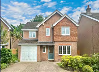
Ringwood £2,350 PCM

A impeccably presented detached, modern house in Ringwood. Four Bedrooms | One Bathroom | Driveway Parking | Garden | Close To Local Amenities | Garage | Cul-De-Sac | Walking Distance To Local Schools.